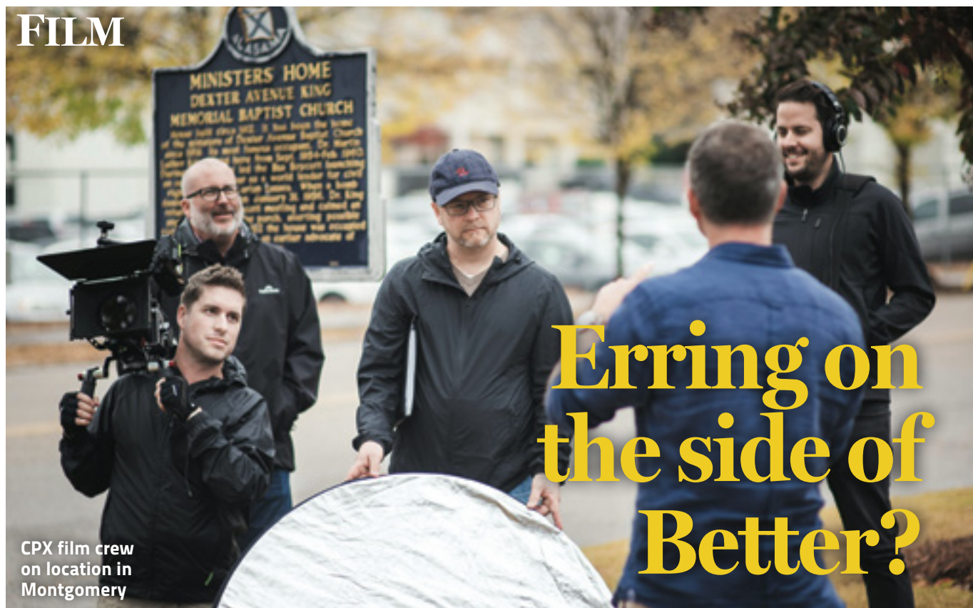
CPX film crew on location in Montgomery