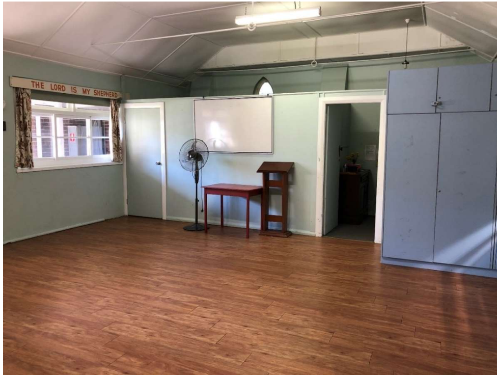
The 'kinder room' with the storeroom on the left side and newer storage cupboards on the right side. This room was built in 1954 following the fire the previous year that destroyed the original building (1934). The new building connected the church providing all weather access through all the buildings.