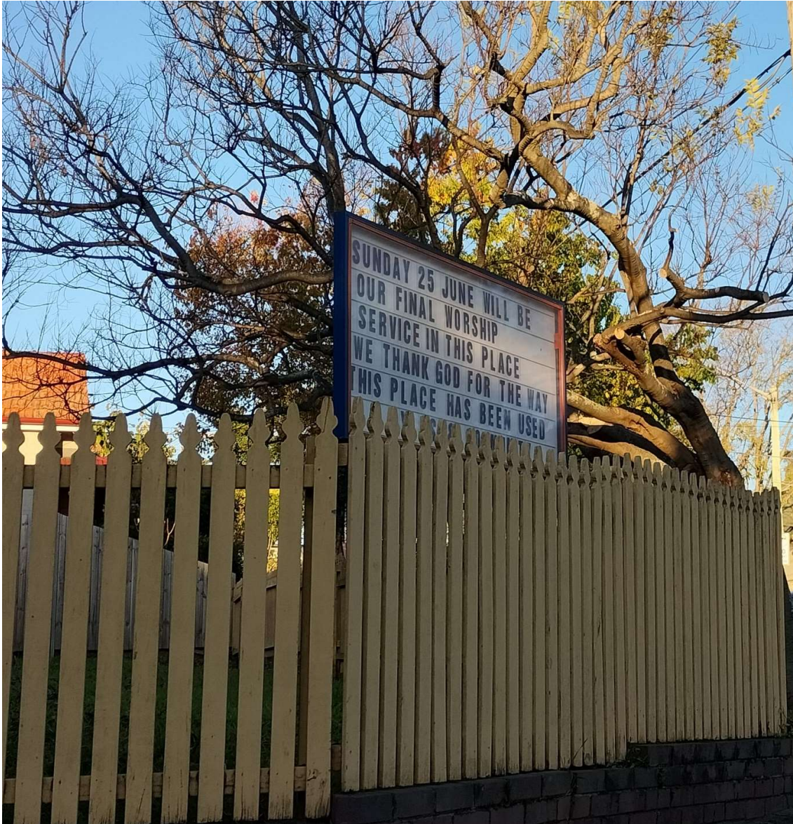
Sign advertising the final service for the Camperdown Stanmore Community Church that was held on 25 June 2023.

The final service concluded the Christian witness of the Methodist and Uniting fellowships over 118 years. A booklet with the order of service and the four messages presented on the day is available on request.