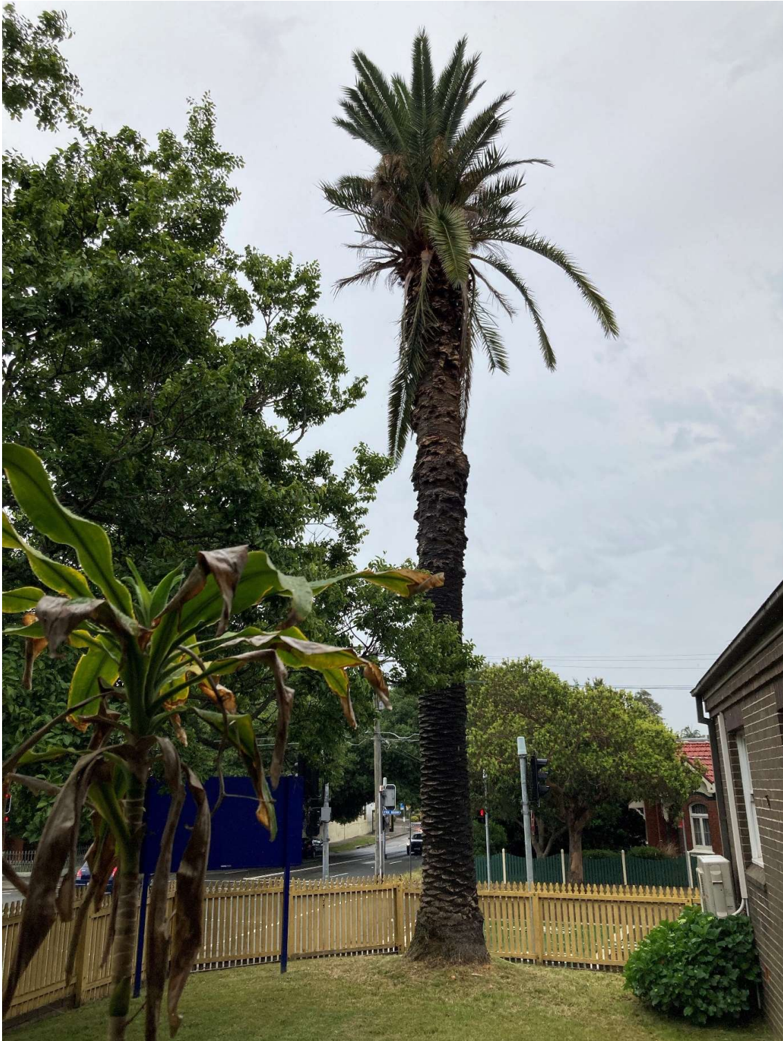
The small but useful backyard area with the now very large palm tree.