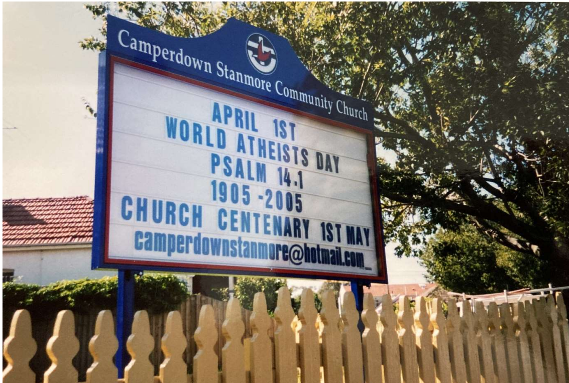
Sign in 2005 with the top name section. This was destroyed in an act of vandalism and was not replaced.