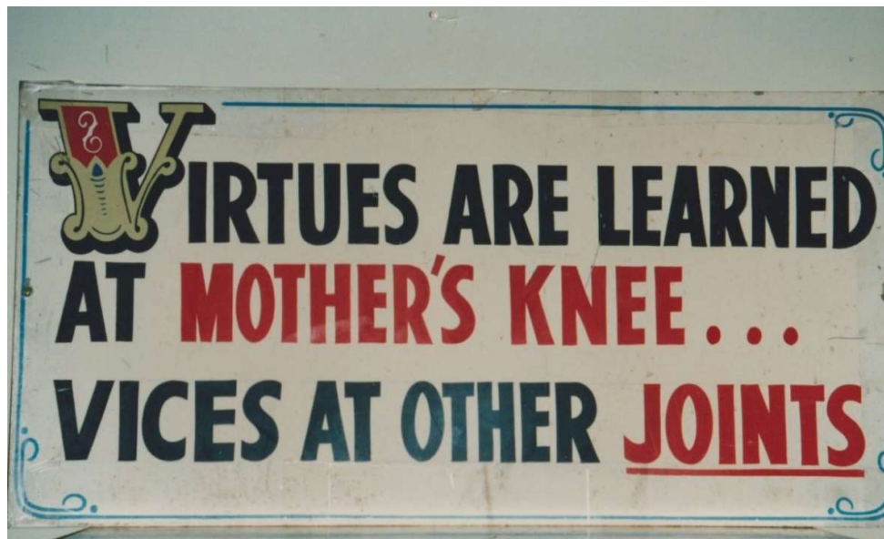
Two examples of early (1960s) West Kingston Methodist signs. The signs were painted on metal and manufactured at the Fitch Bodyworks Factory, through long-standing steward Lou Fitch.