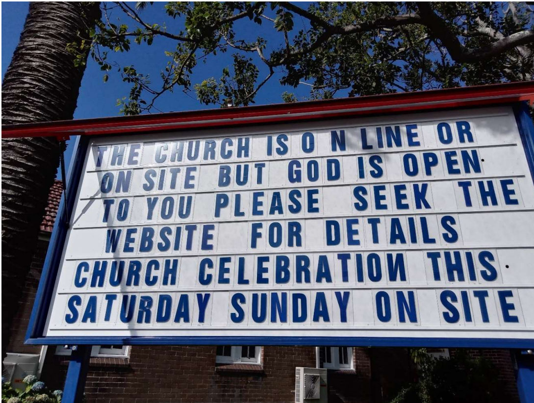
Sign for the January 2023 weekend celebration and thanksgiving time.