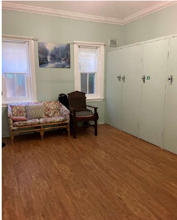
The small room connected to the kinder room with storage cupboards. It has been used for a variety of meetings.