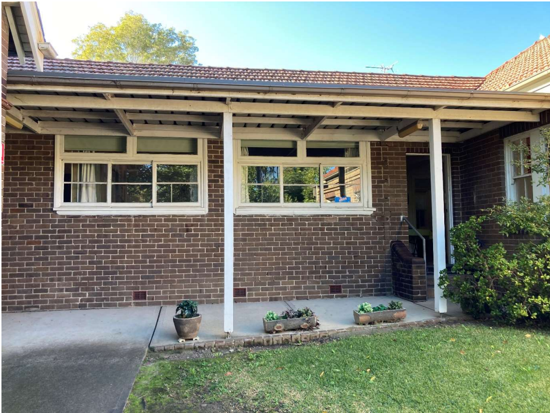
The internal courtyard entrance to the halls and through to the kitchen.