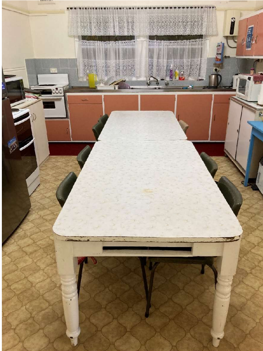
The kitchen area, retaining a mostly 1950s look.