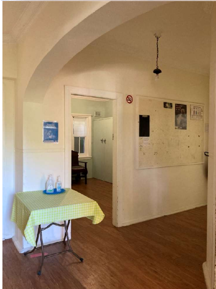
Passageway to the small fellowship/storeroom, and around and through to the kitchen