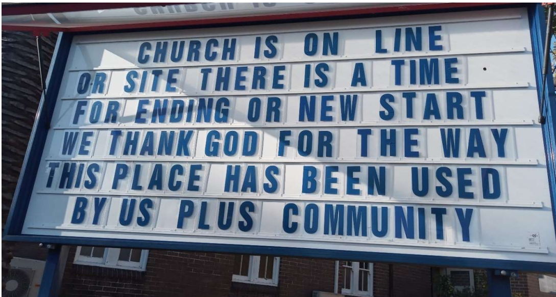
Sign for May 2023 to indicate the coming conclusion of the local ministry at Camperdown Stanmore Community Church.