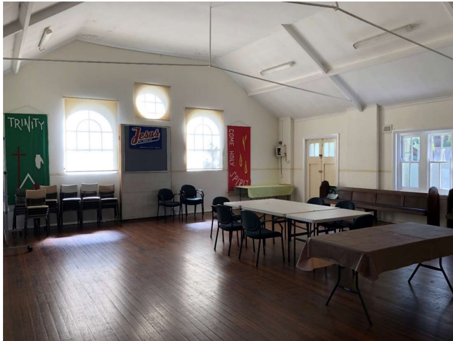
The large hall dedicated in 1933 by Sir Betram Stevens, then NSW Premier and Sunday School Superintendent.