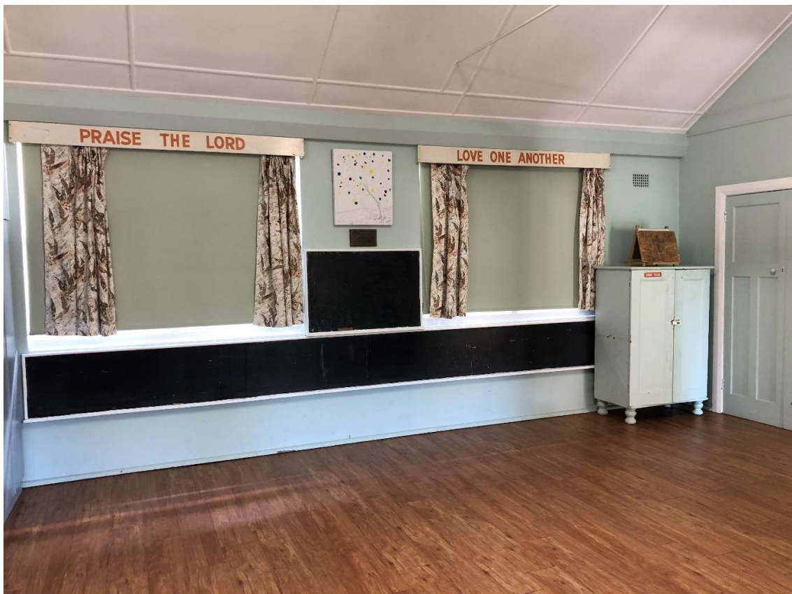
A Pictorial Record of Cardigan Street Church, Camperdown, Sydney, New South Wales