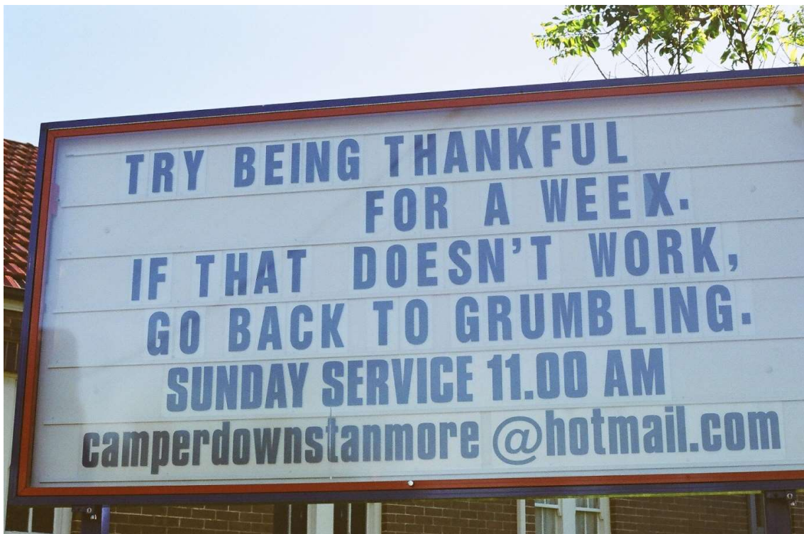
Sign from 2010. It linked in with a seminar for that year.