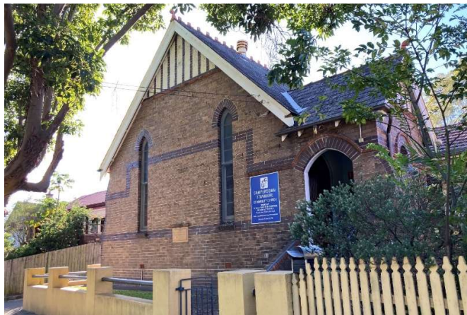
Camperdown Stanmore Community Church 2023